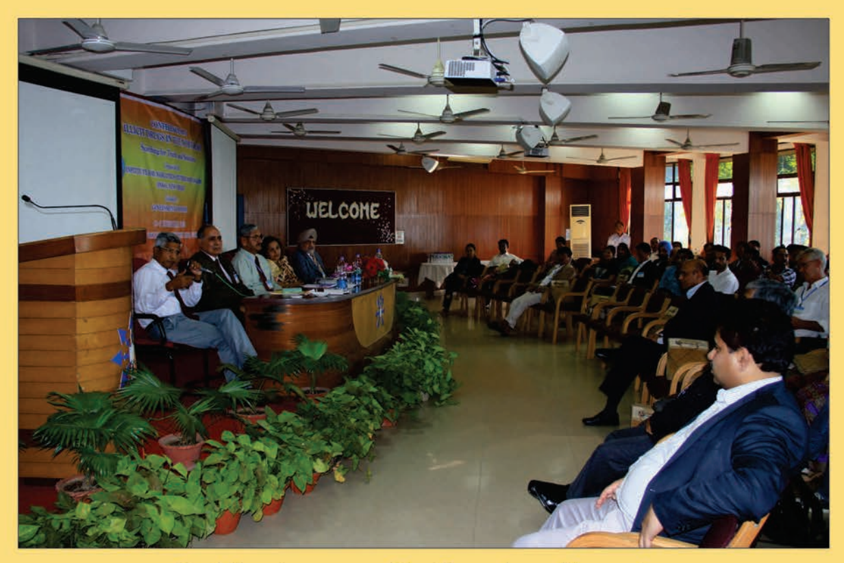
Participants engrossed in discussion with speaker