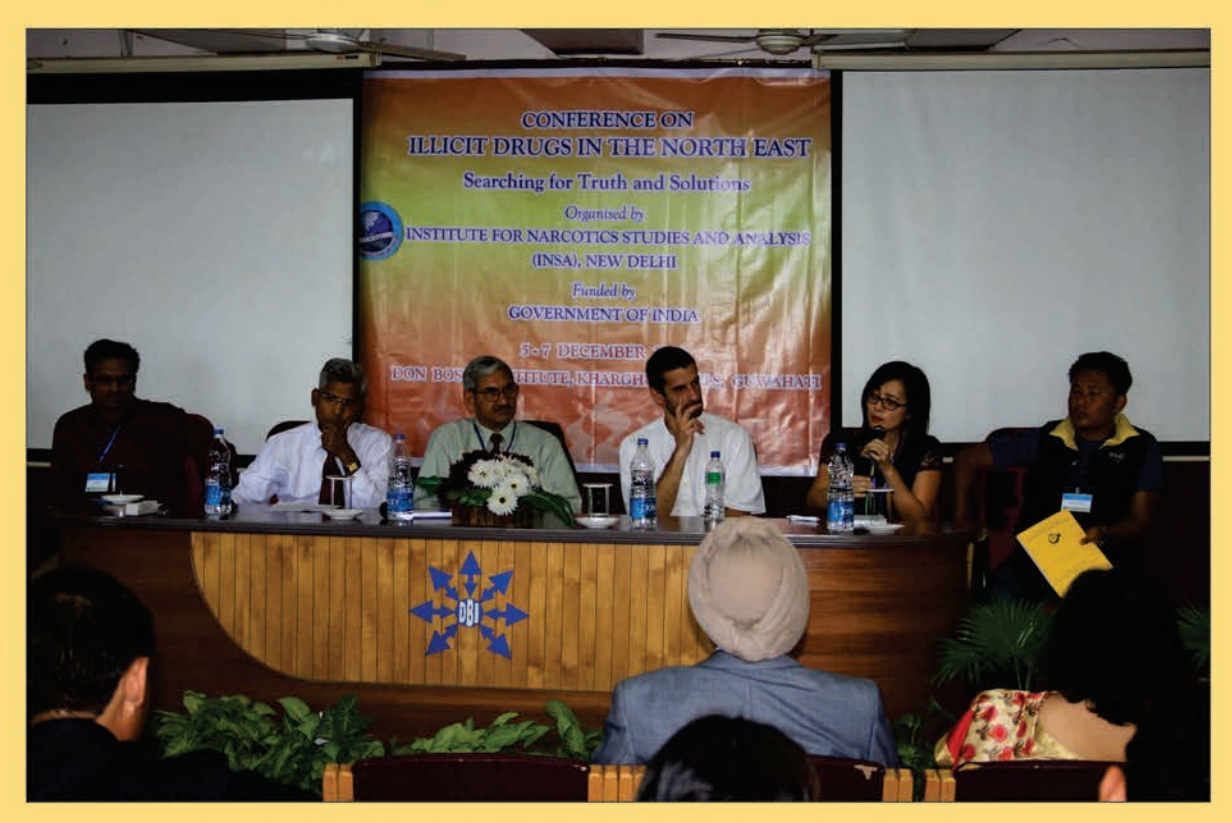
Session on " Current Drug Control Strategies" in progress